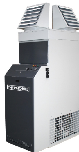
Pro heat 100 S/H