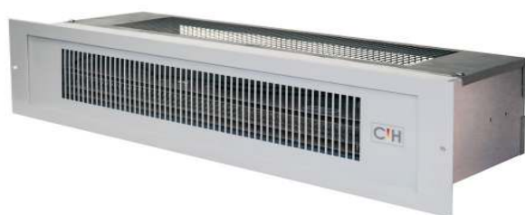
RDH Electric Recessed Over Door Heater