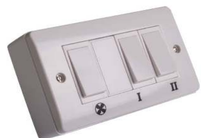
Remote Switch Unit