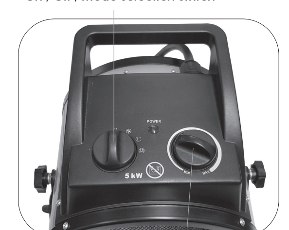
On / Off / Mode selection switch

Note: After operation in heat mode; Set to fan mode and run the heater for a short while to allow it to cool before turning it off.