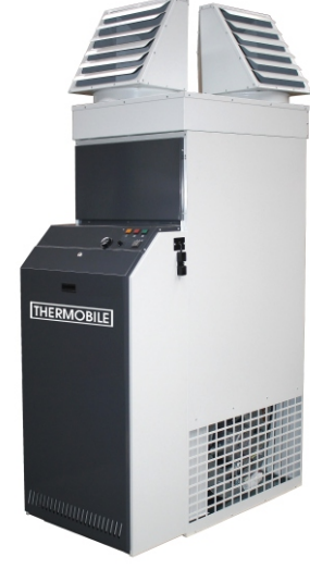
Pro heat 100 S/H