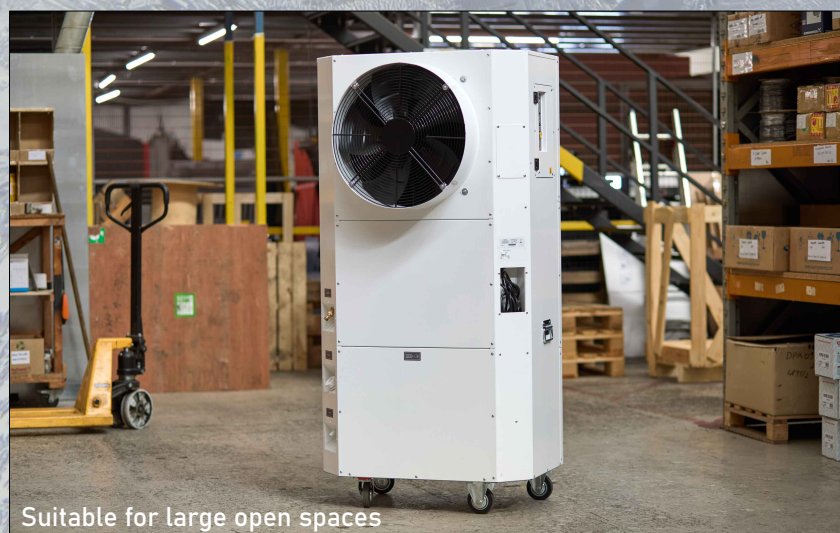
Suitable for large open spaces