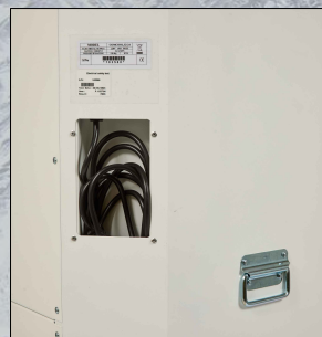
Cable pocket and sturdy grab handles