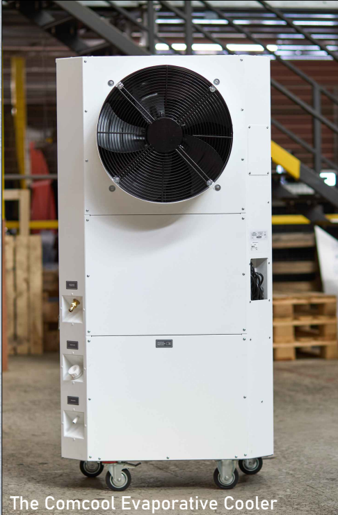
The Comcool Evaporative Cooler

The class leading Comcool is our large volume heavy duty evaporative cooler. Housed within the all steel chassis is a powerful 500MM axial fan and cooling system that can deliver a constant stream of chilled air to help keep staff, guests or processes cool when traditional cooling isn't an option.